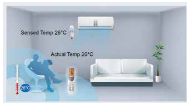
Remote with I Feel

The mini sensor in the remote controller can sense its surrounding temperature, and transmit the signal back to the indoor unit. So the unit can adjust the air flow volume and temperature accordingly so as to provide maximum comfort.