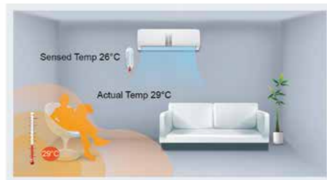
Remote without I Feel